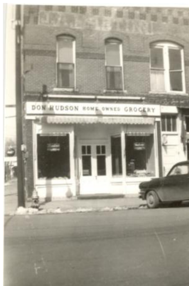
Hudson Grocery around 1948.

Please check back with us at a later date for availability.