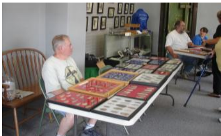
Exhibitors at the Indian Artifact Convention on June 14