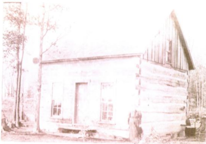
Image of Weaver log cabin